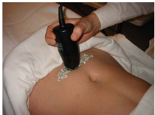
Fig. 3. BladderScan™ BVI 3000. The scanner is gently but firmly moved over the lower abdomen. The scanner may be used for both males and females by selecting the appropriate button during the device set up.

Nurses can learn to use the ultrasound device after five minutes of bedside instruction [45]. Ultrasound scanners are available in some institutions for use in the postanesthesia care unit (PACU), the emergency room and on the ward to monitor bladder volume. The portable ultrasound scanner is accurate \pm 20\% at bladder volumes of <700 ml, and \pm 25\% at