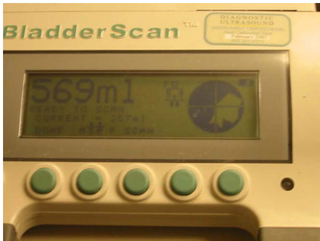
Fig. 4. BladderScan™ BVI 3000. Close up of the screen. The volume bladder is shown on the left and the icon on the right demonstrates a good quality scan because the white area extends across the crosshairs of the dark circle.

volumes >700 ml [49]. It is sufficiently sensitive and accurate enough to detect clinically significant overdistension.