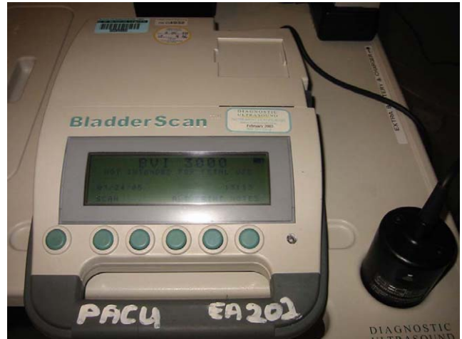
Fig. 2. BladderScan™ BVI 3000 portable bladder ultrasound device.

A number of studies have demonstrated that ultrasound scanning is superior to other methods of predicting bladder volume, such as palpation, duration of surgery and estimation from the volume fluid administered intraoperatively [2,23,45,48]. In one study [23], fluids administered intraoperatively or duration of surgery had weak but significant correlations with bladder volume at the end of surgery (correlation coefficients of 0.26 and 0.32, respectively). The bladder scan measurements of bladder volume on the other hand, correlated strongly ( r = 0.9 , p < 0.0001 ) with catheterized urine volumes. In the same study patients and nurses were asked to estimate the of urine volume just before voiding. These “guesses” were compared with volume of urine measured by