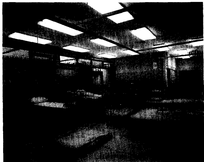
Figure 3. Recovery area at Hornsby Day Surgery Centre.

In early 1993, the AADSC challenged the New South Wales Department of Health over its temporary licensing of facilities unable to comply with new licensing legislation. This required any facility offering anaesthesia beyond simple sedation for surgery or endoscopy to be licensed. The Association's view was that temporary licensing was effectively lowering standards. At the same time, it potentially provided a "windfall" gain in patient benefits for facilities that were little more than "doctors'